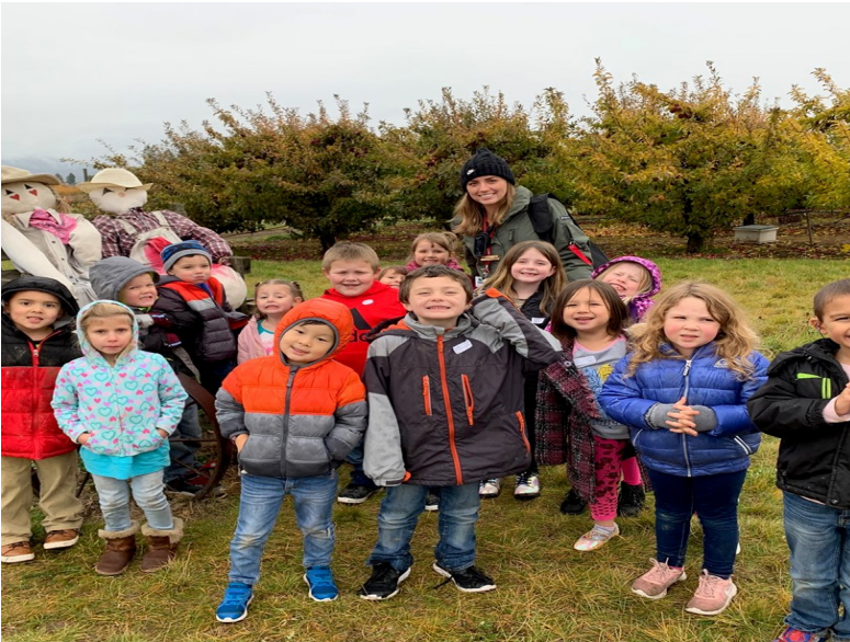
Kindergarten at the pumpkin patch